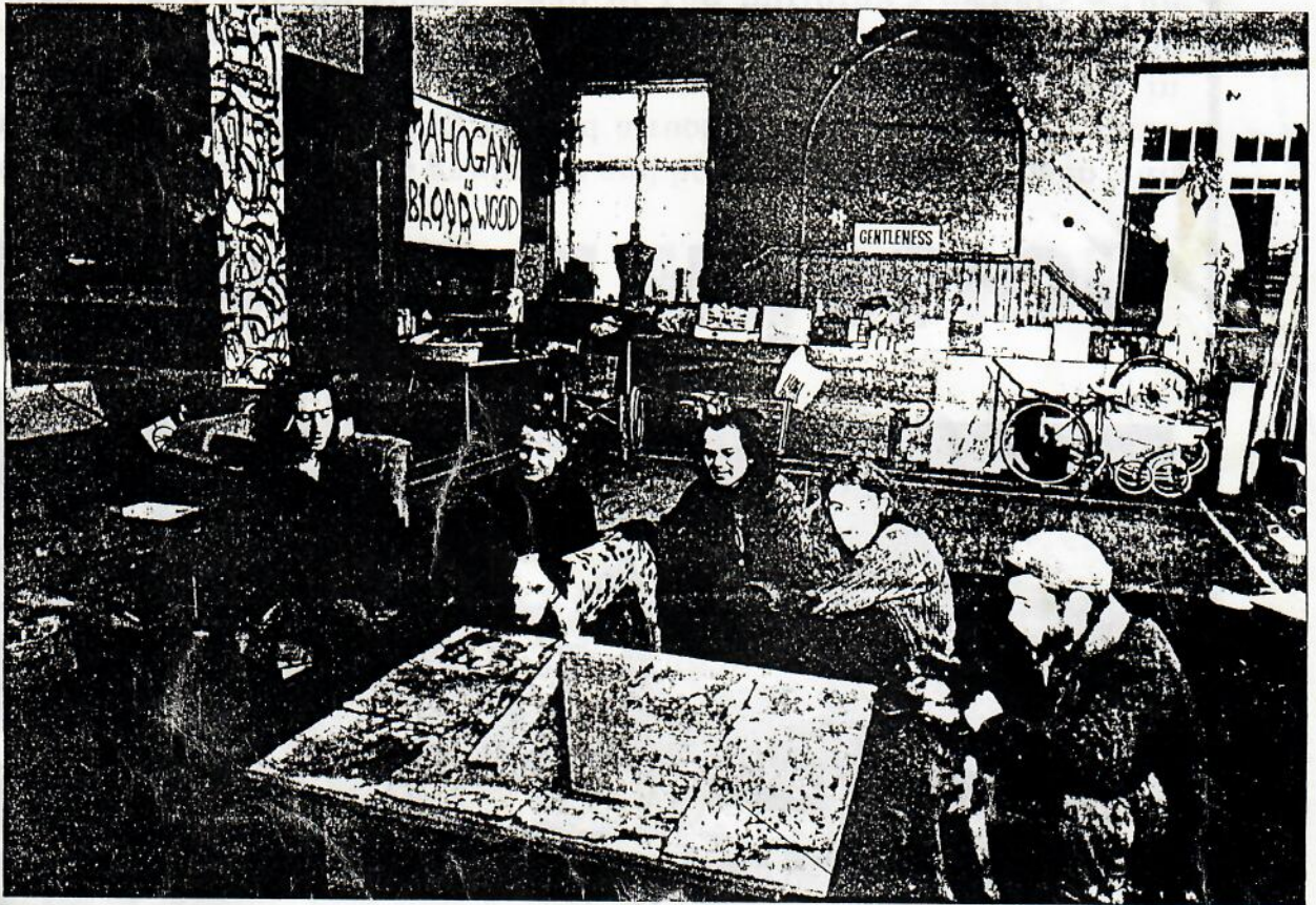
CENTRE FOR THE COMMUNITY: Squatters in the old school hall, beside the memorial hall, where they run an information centre.